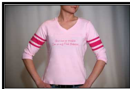
Light Pink 3/4 Sleeve Jersey $14.99