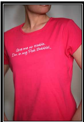
Hot Pink Tee $14.99